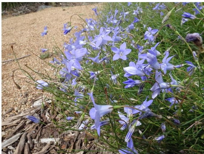
Wahlenbergia capillaris Tufted Bluebell. A perennial species with a thickened taproot.