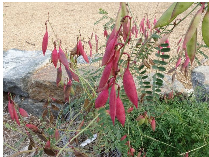
Swainsona galegifolia Smooth Darling Pea. Flowering for the last 2 months, now there are the seeds pods.