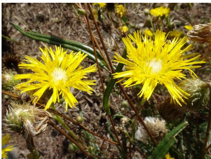
Podolepis jaceoides Showy Copper-wire Daisy. An attractive long flowering perennial daisy.