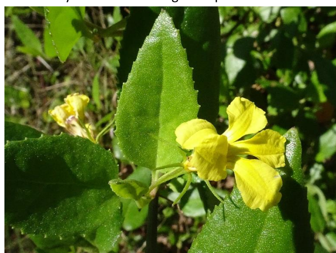
Goodenia ovata Hop Goodenia. A long flowering rounded shrub that responds to pruning.

There are still some sections of our paths are damaged so please take care when visiting. Our working bees are each Thursday morning from 8am. Morning tea (byo) is at 10am at the tables near the shed. Tools are supplied. New volunteers are welcome, just turn up and make yourself known.