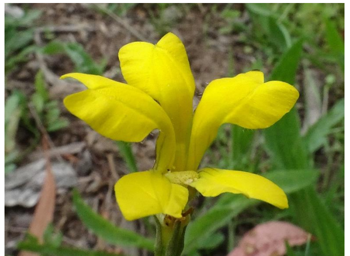
Goodenia pinnatifida Cut-leaf Goodenia. A widespread species in the ACT according to Canberra Nature Map.

Our working bees are held each Thursday morning from 8am. Morning tea (byo) is at 10am at the tables near the shed. Tools are supplied. New volunteers are welcome, just turn up and make yourself known.