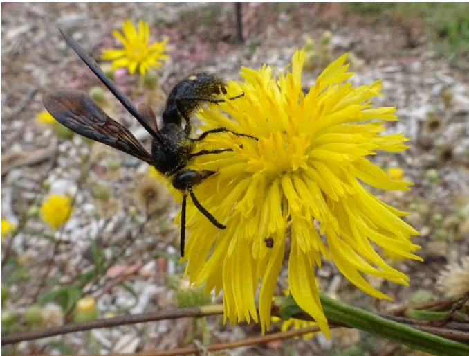
Laeviscolia frontalis , Two-spot Hairy Flower Wasp on Podolepis jacioides Showy Copper-wire Daisy.