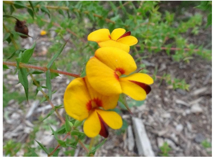
Pultenaea spinosa Spiny Bush-pea. An erect shrub to 2 m but which can also be prostrate.