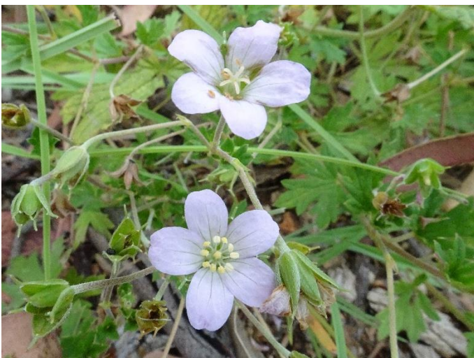
Geranium potentilloides . Cinquefoil Cranesbill. A prostrate perennial herb with a thick taproot.