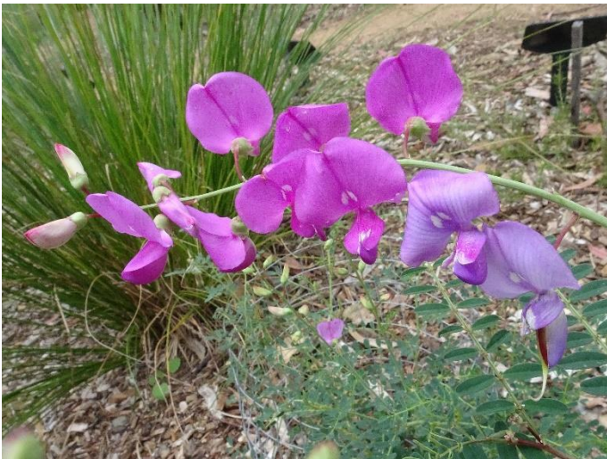
Swainsona galegifolia Smooth Darling Pea. A long flowering perennial pea. Worth a place in a garden.