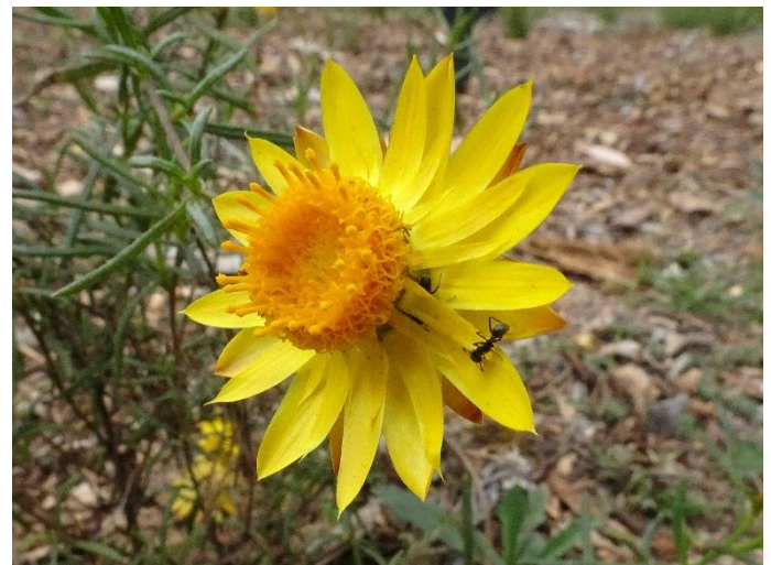
Xerochrysum viscosum Sticky Everlasting with some Iridomyrmex purpureus Meat Ants.