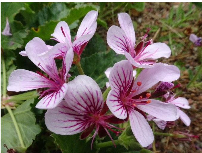
Pelargonium sp. Striatellum Omeo Storksbill. A yet to be formally named endangered species.