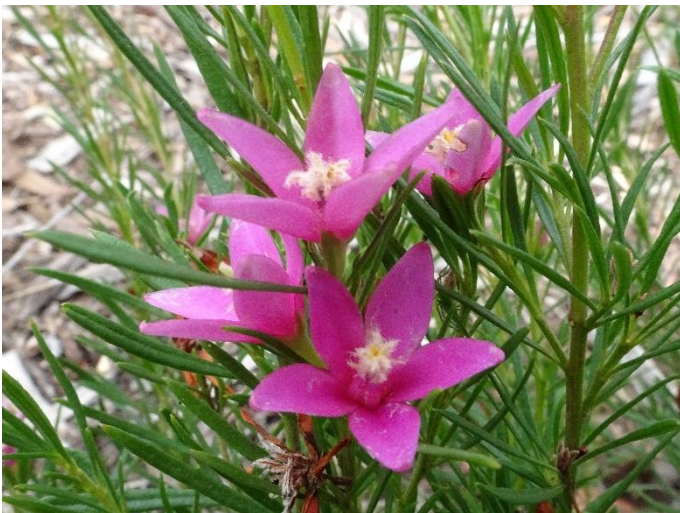
Crowea exalata Ginninderra Falls. An attractive long-flowering local species.