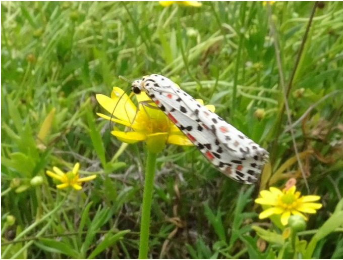
Utetheisa pulcheloides Heliotrope Moth on Ranunculus papulentus Large River Buttercup.