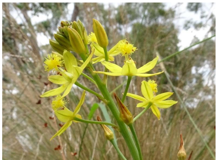
Bulbine glauca Rock Lily. Presumably self-sown as it is trying to compete with exotic grass species.