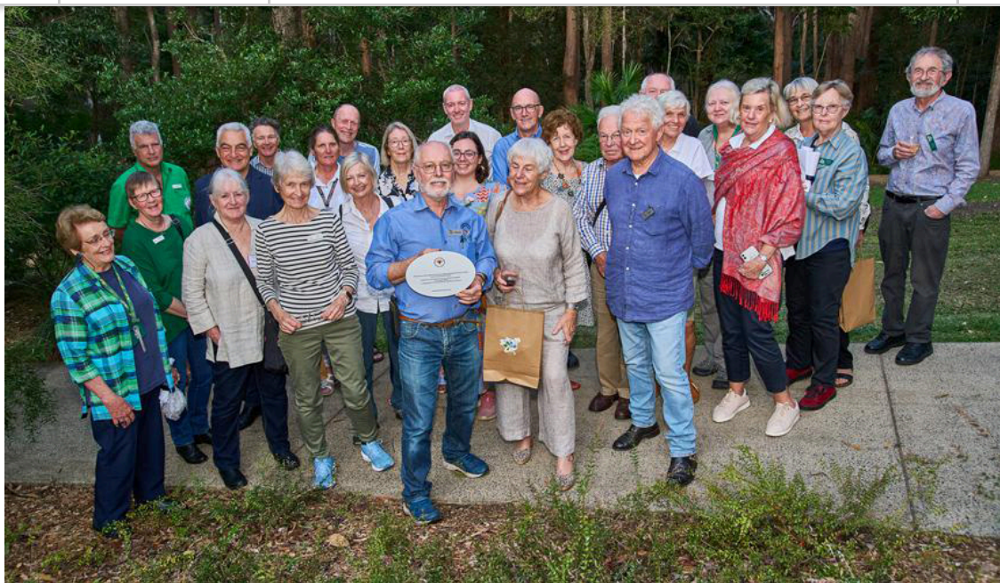
AAFBG (Australian Association of Friends of Botanic Gardens) conference opening night hosted by the Friends of Maroochy Regional Bushland Botanic Gardens Tanawha, Sunshine Coast, Queensland 23/08/24

Maroochy welcomed the opportunity to share with visiting delegates great examples of involving Friends in a range of botanic garden and related science activities in cooperation with their local Council.