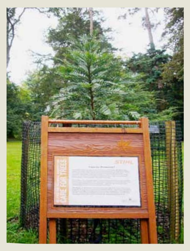
The thriving Wollemi Pine behind its sign sponsored by Stihl!

More information: www.forestry.gov.uk/westonbirt