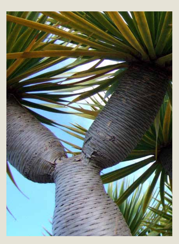
dragon's blood tree. Photo: Zyance

National Arboretum Canberra - Booklet on Forest Plantings 2010 www.canberratimes.com.au/news 30 July 2010 www.abc.net.au/gardening/stories Fact Sheet: Dragon Tree www.waite.adelaide.edu.au/arboretum Dragon's Blood Tree The Friends of the Waite Arboretum Inc Newsletter No 55 Autumn 2008 "Dragons Decapitated!" by David E Symon www.teneriftimes.com/contenrt/view The Tenerife Dragon Tree en.wikipedia.org/wiki/Dracaena_(plant) mature tree photo: http://commons.wikimedia.org/wiki/Dracaena_draco .