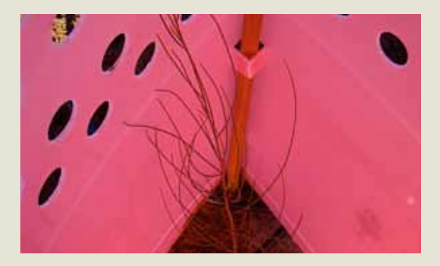
Successfully planted Arboretum