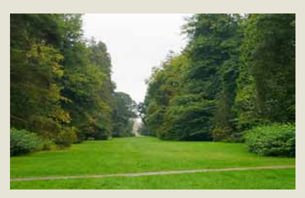
One of the grand Allées of old growth trees looking towards the (now) Westonbirt School.