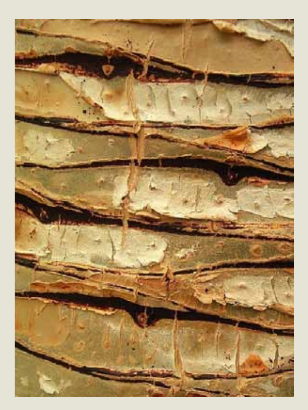
dragon's blood tree bark.