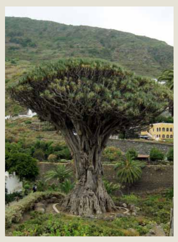
Mature dragon's blood tree