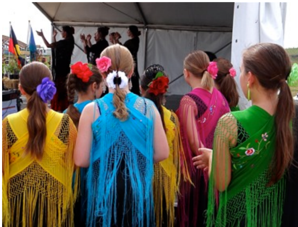
Left: Beautifully dressed young Spanish dancers waited for their turn to perform on stage.