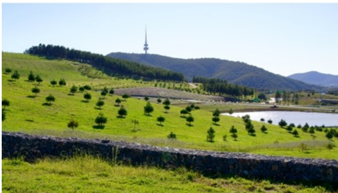
The Arboretum on a perfect Easter morning in 2012... We think it's special too! (Ed.)

I recommended after my visit to Canberra in 2010 that Canberra look to Freiburg, the green heart of Germany, for inspiration and a comparison of what it should be aiming to become. Freiburg is a model green city. It contains a whole series of carbon-neutral estates and has attracted one of the largest solar institutes in the world. This is an excellent beginning to becoming Australia's green heart.