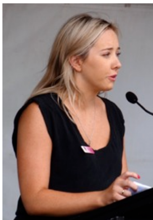
Top: Katy Gallagher MLA, ACT Chief Minister, opened the Festival.