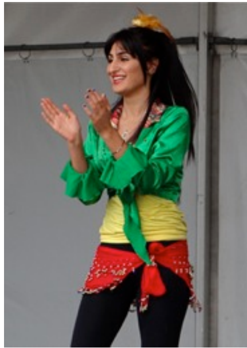
Left: Dancers from the Sydney Turkish Dance Ensemble gave an all-male performance, followed later by an all-female performance.