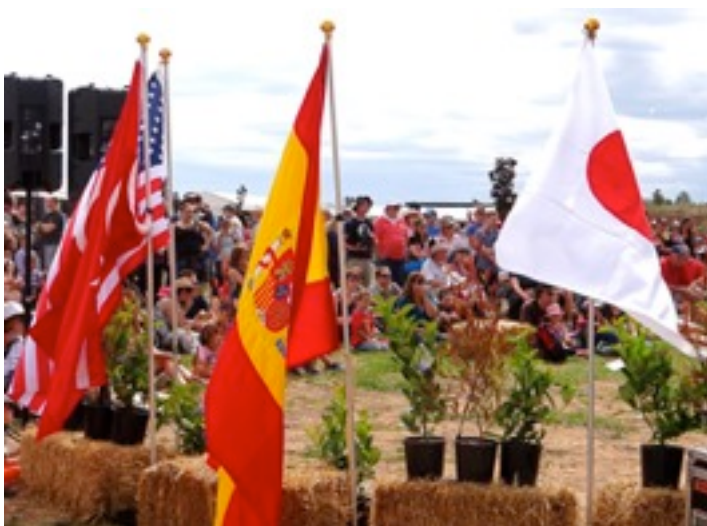
Below: Flags of the participating nations adorned the area in front of the stage, creating a multicultural splash of colour.