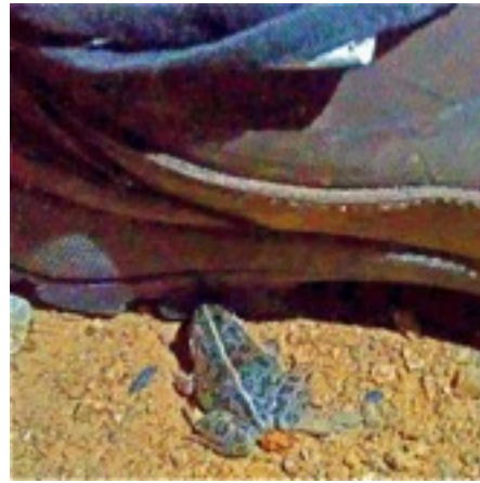
Figure 1. Spotted grass frog on road at STEP Lot 100 ephemeral wetland, March 2012.

The main dam was also of great interest because the banks at water level (it was full to overflowing) were covered in a band of densely-growing sedges and reeds (Figure 3). This is the first time this has happened since it was created several years ago. These were all 'naturally planted', presumably from seed carried in the runoff, or on the feet of the large flock of ducks that make the water their home. Since mid-March, there has been significant landscaping work at the dam, with areas of wetland plants being planted, as well as the recent removal of the delta at the bottom of the Central Valley. The increased vegetation around the margins should assist in building the frog population and our observations will help to document this.