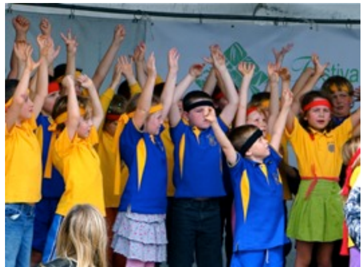
Above: Giralang Primary School's 'Six Seeds' performed their unforgettable 'Kurrajong Rap'.