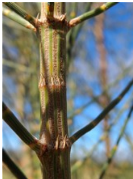
Close-up of the healthy young shoots on the tree above.