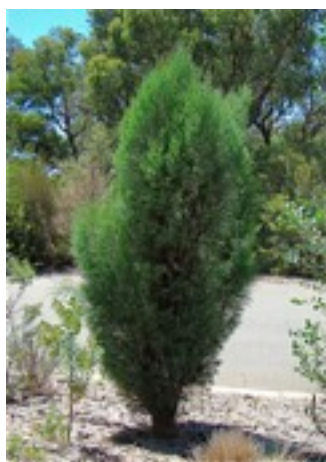
Left: One of several South Esk pines growing at the Australian National Botanic Gardens.

The female cones can be found attached directly onto short thick fruiting branches. They are grey and egg-shaped, 12–24 mm long and 10–24 mm in diameter at maturity, with six cone scales arranged in two rings of three. The three inner scales eventually open to shed numerous dark brown, three-winged seeds, 1–3 mm long and around 2 mm wide. Sometimes the cones retain viable seed for several years after maturity.