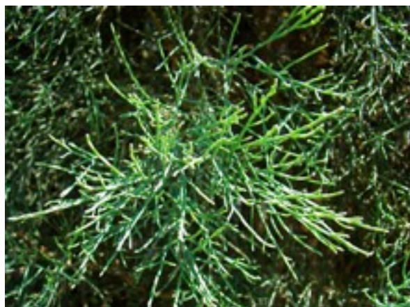
Below: The foliage is fine, soft and blue-green in colour.