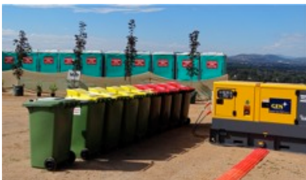
Close to opening time and recycling bins, portaloos and a generator were ready for action.