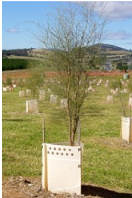
Super-fast tree growth recorded in the Friends Forest on 8 April 2012.

Our happy band of tree measurers at the end of a Tuesday session on 4 April 2012.