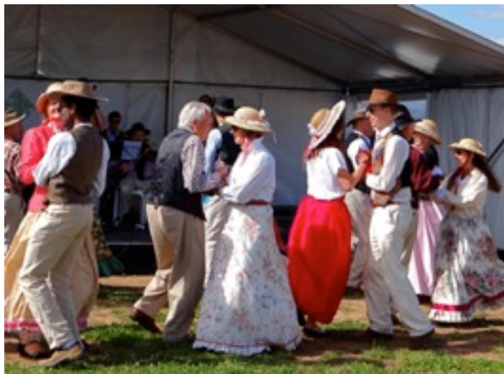
Bush Dancers display group with the Southern Cross Band and Bush Capital Band.

Thanks again to all of you who made the 2012 Festival so successful.