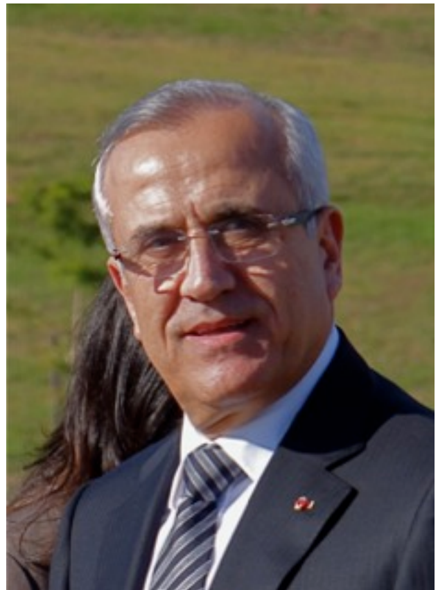
Above: The party arrived amidst considerable fanfare.