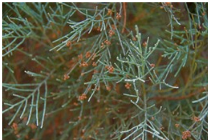
Top: Lot 30 is a rugged, undulating site.