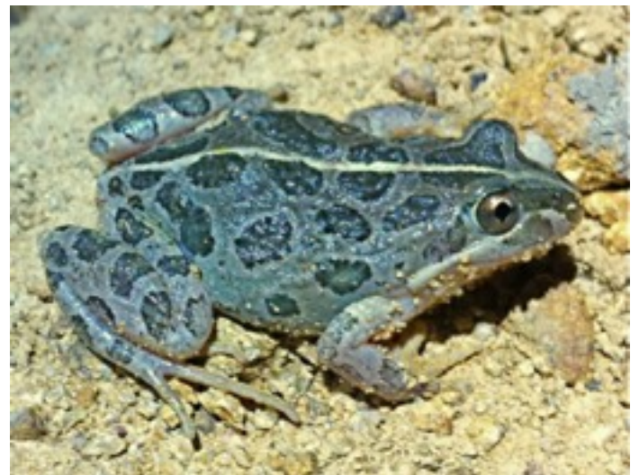
Figure 2. Spotted grass frog on south bank of main dam, March 2012.