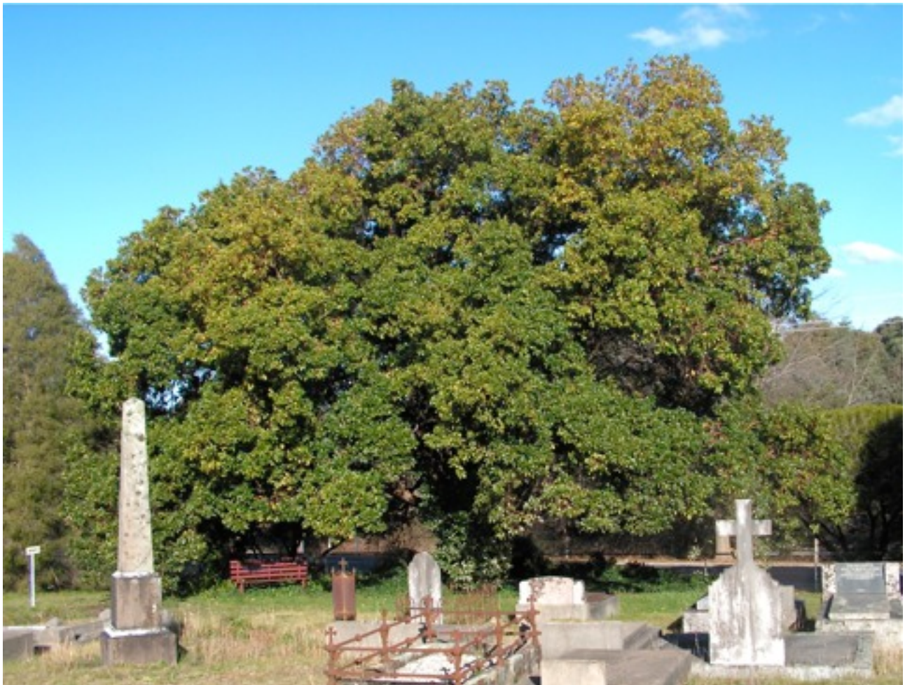
The 135 year-old canary madrone in Yackandandah Cemetery