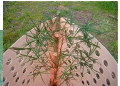
(Above) Queensland bottle tree seedling with fine, divided leaves, but they are not always like this