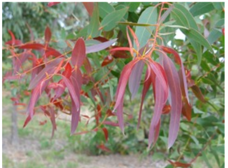
In the pink: the new leaves on the purple-leaved smokebush (left) emerge as pinky-red and many new shoots on the Camden white gums (above) show a similar colour