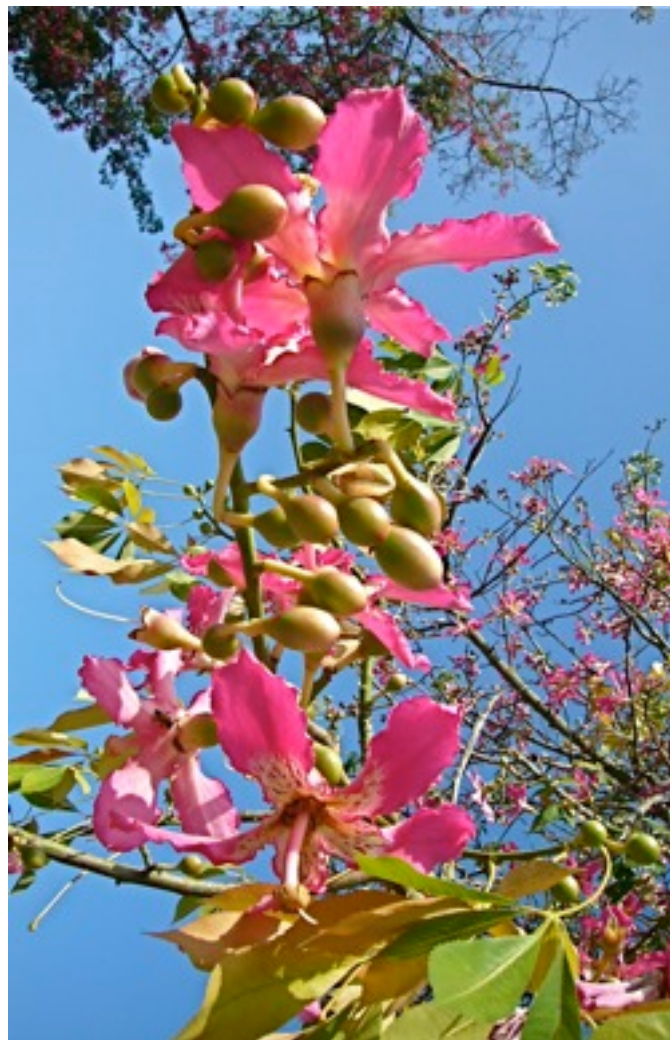
The beautiful pink silk floss tree's 9 cm blossoms

The entry fee is $8.00 for adults and there is an excellent gift shop staffed by the Friends (called Los Voluntarios); also guided tours, great educational programs and holiday 'camps' for kids. This arboretum is definitely worth a visit to see another side of LA and visitors can also take in the outstanding Huntington Garden Museum which is relatively close-by.