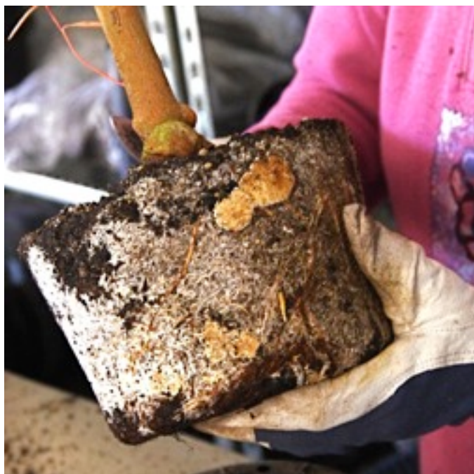
Figure 2. Truffle that was flattened between soil mass and side of pot.

Australian National Botanic Gardens and Australian National Herbarium, and sponsored by the Friends of the ANBG.