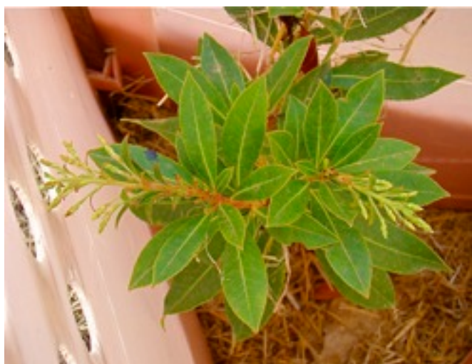
(Above) a tiny tree in bud within its tree guard in February 2011 and (top) seven months later another of the Arboretum trees flowering above its tree guard

I was looking for a mature tree in the Canberra region to photograph but was unable to locate any. There are plenty of other Arbutus species here but A. canariensis seems to be absent. If anyone knows of any, please