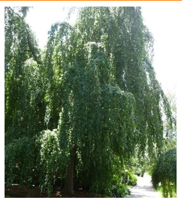
A weeping form of the tree in the Royal Tasmanian Botanic Gardens showing the characteristic graceful drooping foliage.