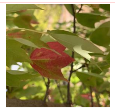
science news magazine 'Future' website <u>here</u>

just another perspective on how important the natural world is to our health and well-being, and the key role institutions like the Arboretum can play in increasing people's awareness and appreciation of the natural world around them. Read the article by Christine Ro in the BBC online