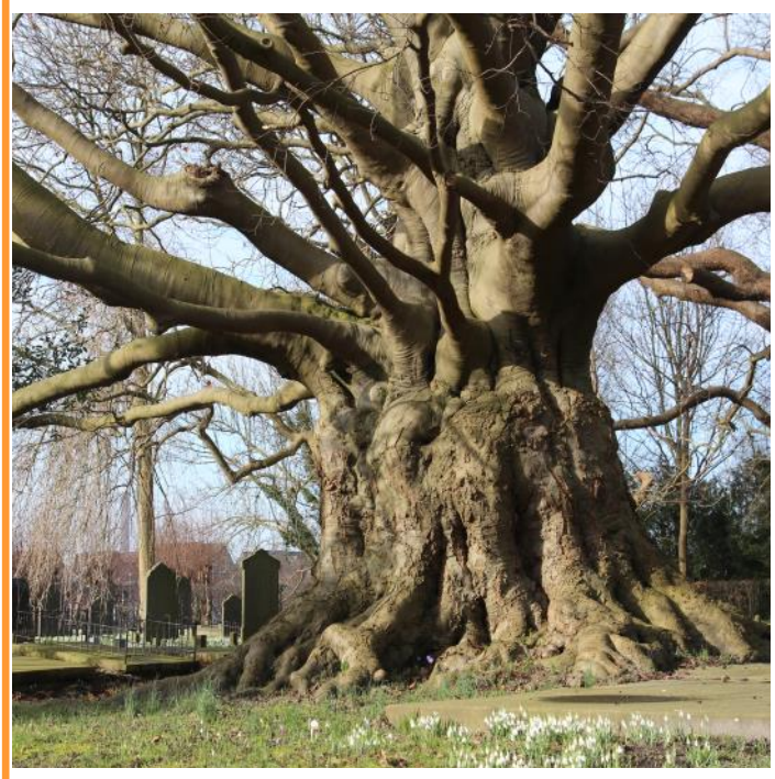
European beech, Fagus sylvatica 'Atropunicea', in the Groenesteeg cemetery, Leiden, Netherlands. This tree was planted around 1830

European beech is a large deciduous tree, often called the finest specimen tree available, with green or purple foliage, dense shade, colourful autumn foliage, and attractive architecture, both upright and weeping. The European beech can live more than 150 years and can grow 30-40 metres in height with a spread of 10-13 metres.