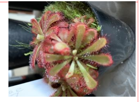
Look out for more opportunities to hear from these passionate growers and see their superb specimens

Owen persuaded us that growing these exotic plants can be successfully achieved in our region without the need to special facilities.