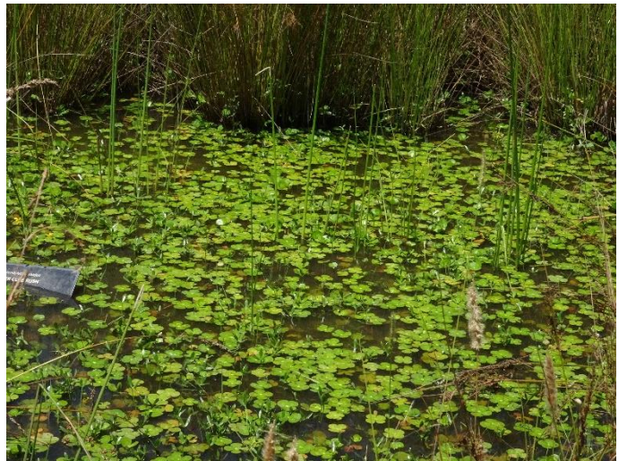
Marsilea drummondii , Nardoo. An aquatic fern that is beneficial for frogs. They are noisily calling here today.

Our working bees are continuing in these uncertain times. Check in CBR is required at our shed. A BYO morning tea is held at the tables near the shed. We have sufficient chairs to be able to space out.