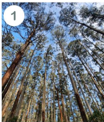
Mountain Ash Eucalyptus regnans