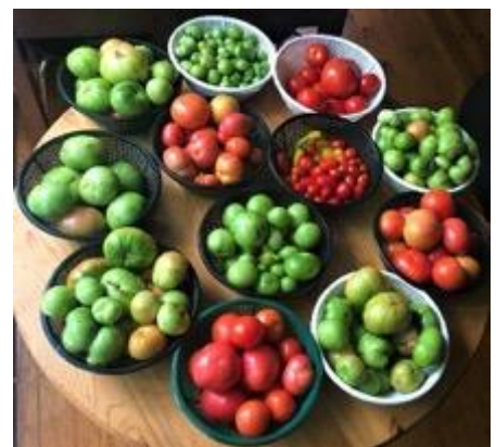
Tomato Harvest 2022

April is usually a very busy month when produce in the garden is harvested and processed to be sold at market stalls. Tomatoes were mainly green when harvested and had to ripen indoors in order to make the very popular Hot and Spicy Tomato Relish. Unfortunately, half way through April, Ange contracted the Covid-19 virus so had to distribute the left-over green tomatoes to Danielle Hyndes to make Green Tomato Chutney and to Del Da Costa who made many jars of Green Tomato Fruit Mince. This was a new product to try out this year.