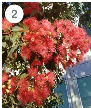
Red Flowering Gum Corymbia ficifolia