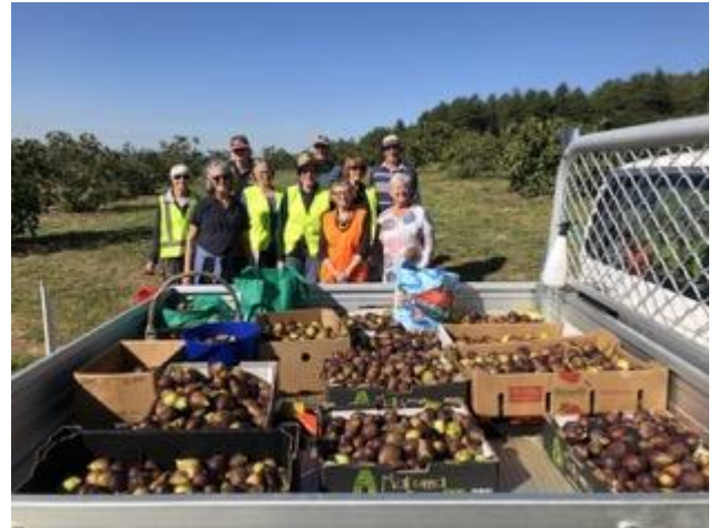
The Figgers with their bountiful harvest