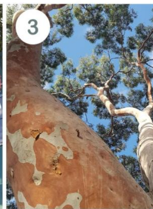
Sydney Red Gum Angophora costata